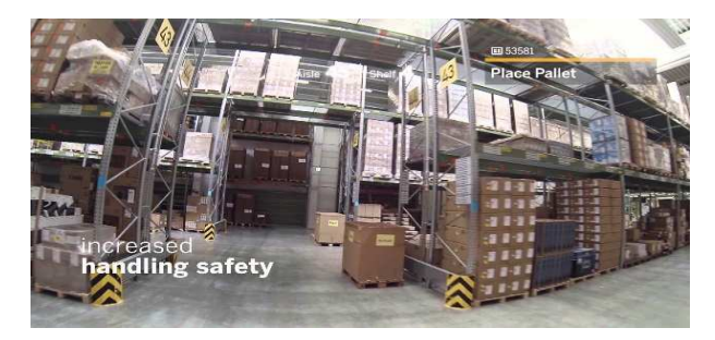
Figure 4: Warehousing Operations