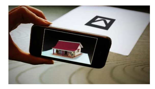
Figure 7: Marker Based AR

AR markers are images detected by camera and which can be linked with software as the location for virtual assets. Colors can be used as long as the contrast between them is recognized by camera, mostly black and white are used. Simple AR markers can be of more than one shapes made up of black squares against white background[9]. A camera with AR software is used to detect AR markers for location. The image can be viewed on a screen and digital assets are placed into the scene at the place of markers. Limitations on types of AR markers that can be used are based on software that recognizes them. The simplest type of augmented reality markers are mostly black and white 2D barcodes.