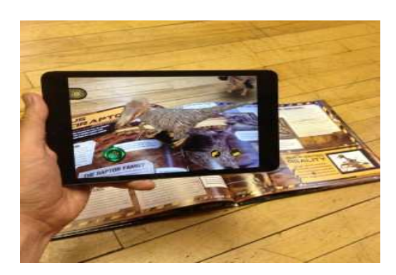
Figure 3: AR for Books

AR technology inside books can help to create a virtual story which will be easy to understand by the user and to create immersive reading experiences. Possible applications: