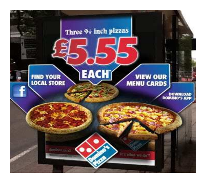
Figure 2: AR for Printing and Publishing