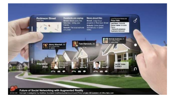
Figure 8: Marker Less Based AR