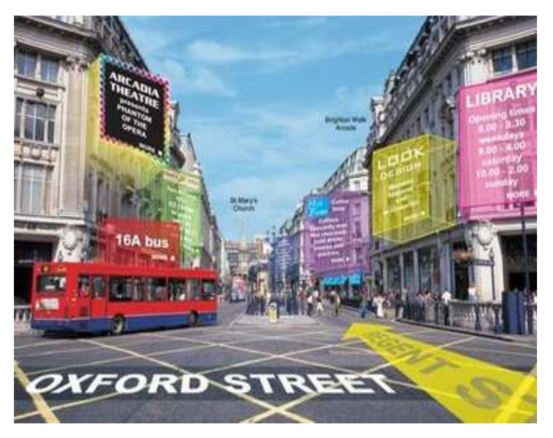
Figure 1: Application of AR